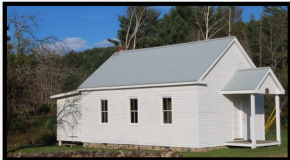
District #4 One-Room Schoolhouse Irishtown, NY

Every September, K-4 grades from Minerva Central School visit the Museum. The Society sponsors an Essay Contest with an awards ceremony in October. We are dedicated to encouraging children's knowledge of Minerva history. The Mabel Jones Scholarship, supported by an Endowment Fund, grants a scholarship to an outstanding graduating senior from Minerva Central School, each year. The fund has reached a level which provides significant assistance to a student for continuation of his/her education.